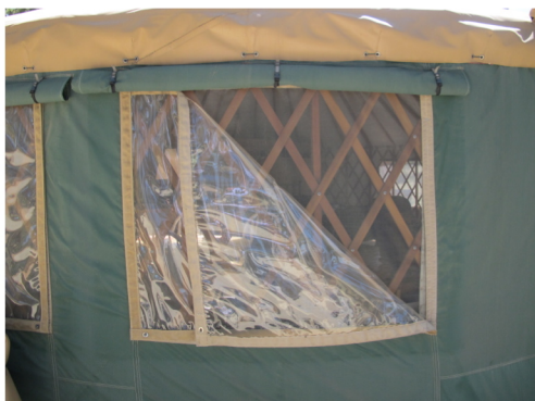
To Open Up Outside Windows for Extra Circulation