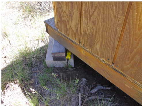
Screwdriver for Unscrewing Front Panel