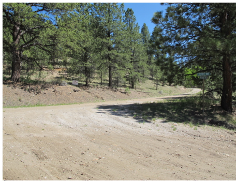
Right at Junction