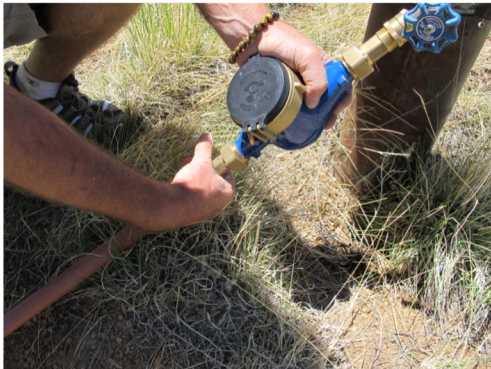
Connecting Hosepipe to Pump