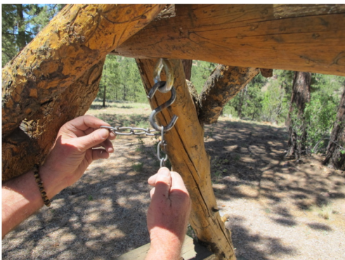
Hooking up the Swing Bench