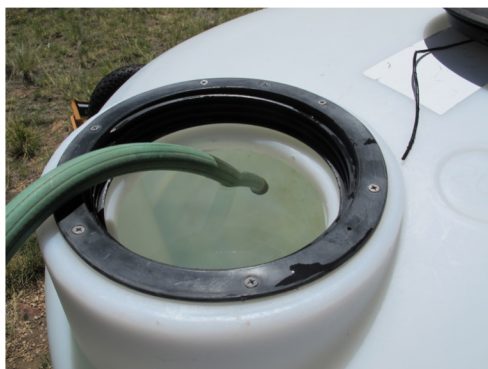
Hose Pipe in Tank