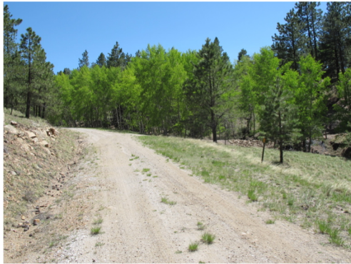
100 Feet from Drive & Home