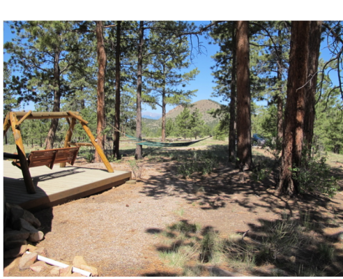
Bench & Hammock in Place