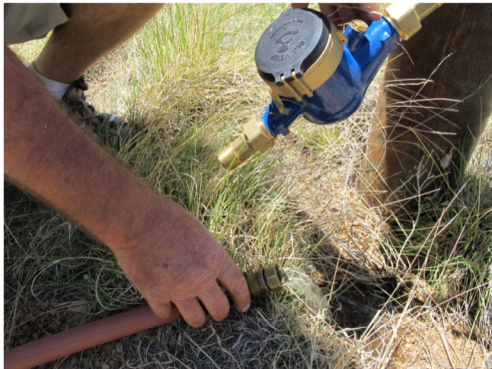
Connect Hosepipe to Pump