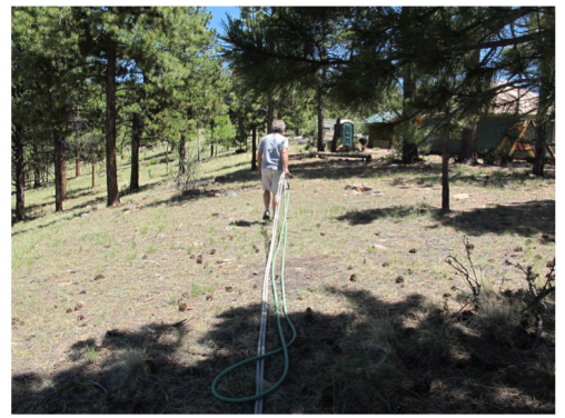
Laying Hose Pipe