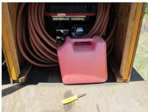
Fuel Tank Water Hose Pipe & Generator