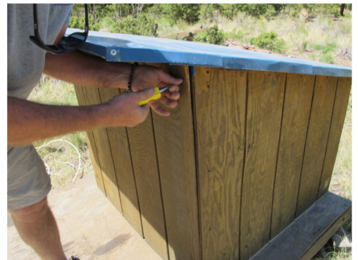
Generator Box Panel Being Unscrewed