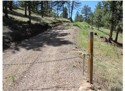
The Chain Post