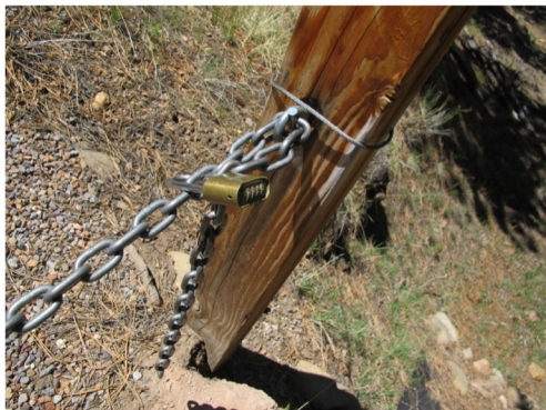
The Chain and Padlock