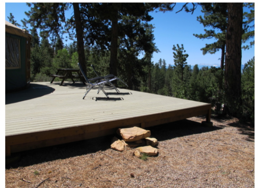
Steps up the Deck. Key to Right