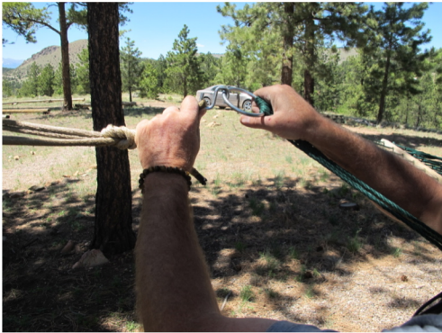
Connecting the Hammock to the Tree