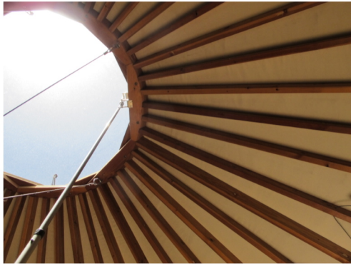
Hook Pole to Eye Let on Screw Gear