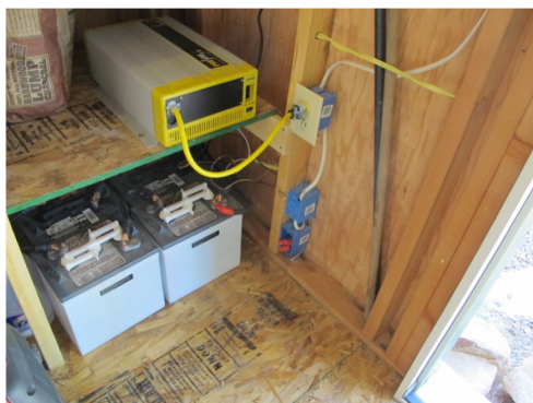
Power Supply Inside Shed