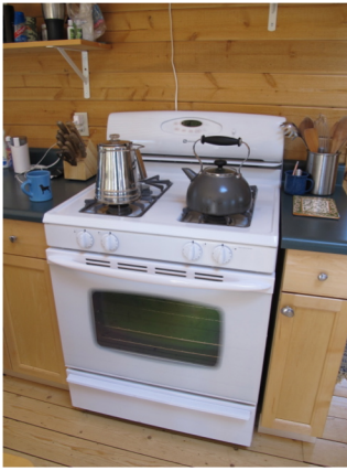
Gas Cooking Stove