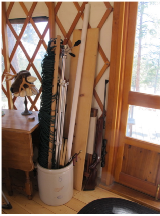
Flap Pole / Hammock / etc