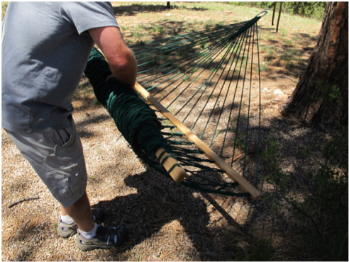
Slowly and Evenly Unfurl the Hammock