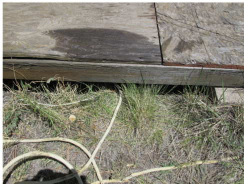
Power Cord Head Hidden Under Front Generator Platform