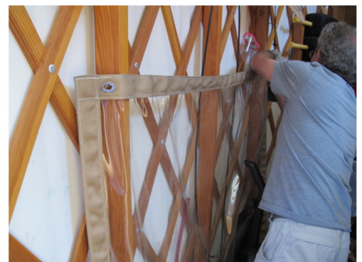
Store in Yurt on Screws in Utility Behind Bed