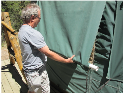
Rolling Up Flap Tight and Even with Nylon Straps Inside