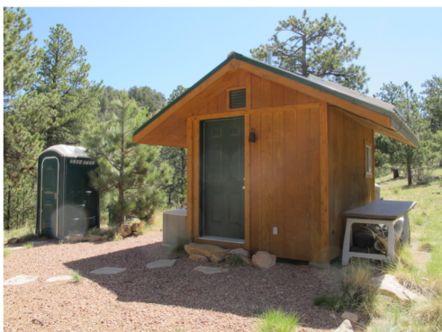
Wooden Shed / Shower / Power Room