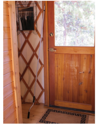
Pole to Open / Close Sky Light by Back Door