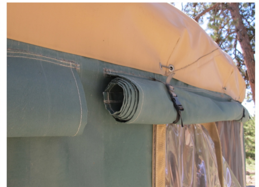
Secure Tightly to Ensure Water Run Off