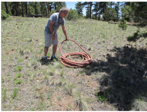
Unfurl Hose Pipe