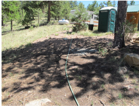
Laying Hose Pipe