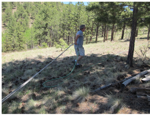
Laying Hose Pipe