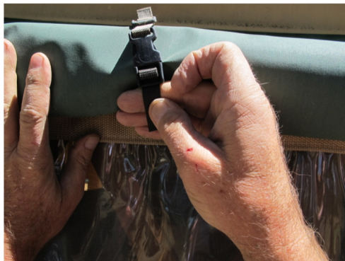
Secure the Three Clips