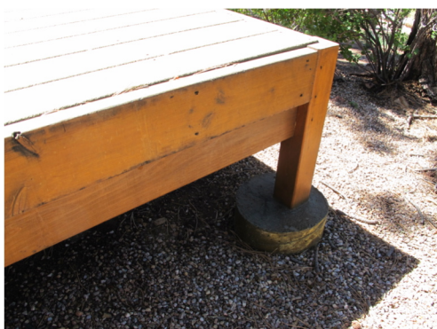
The Key Underneath Deck & Right Post