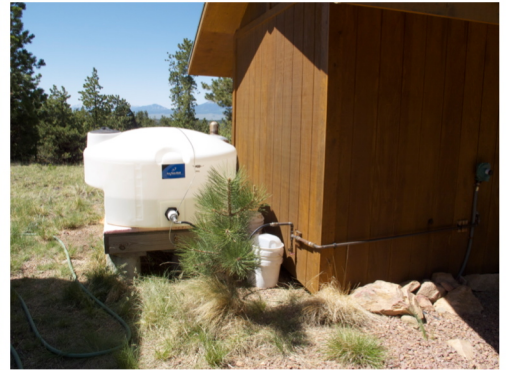
Fresh Water Tank