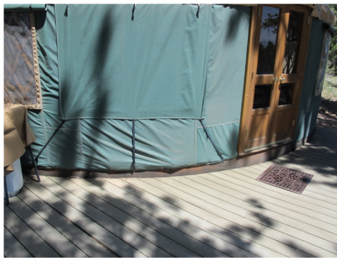
Secured Window Flaps