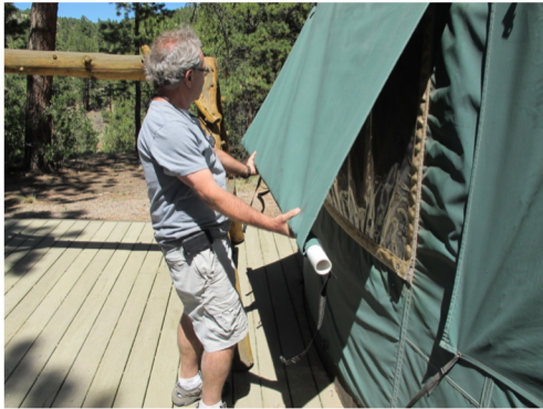
Position Pipe and Tightly Wrap Material and Begin to Roll up