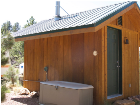
Storage Box for Hoses Pipes