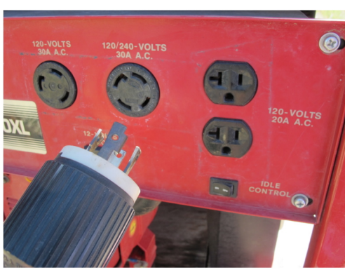
Power Connection Cable to Pump