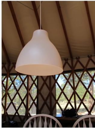
Turn Light Bulb to Turn Light On and Off