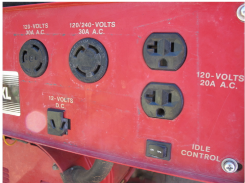
Generator Outlet Points