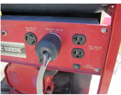
Insert and Twist to Right to Secure