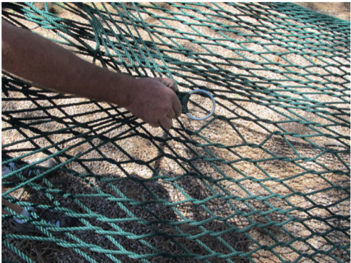
Unfurling the Hammock