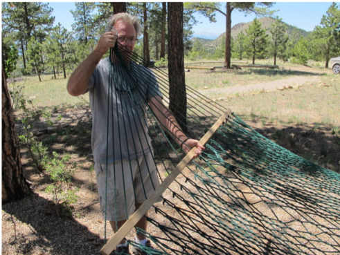
Unfurling the Hammock