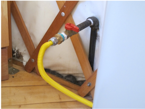
Gas Tap Next to Heater