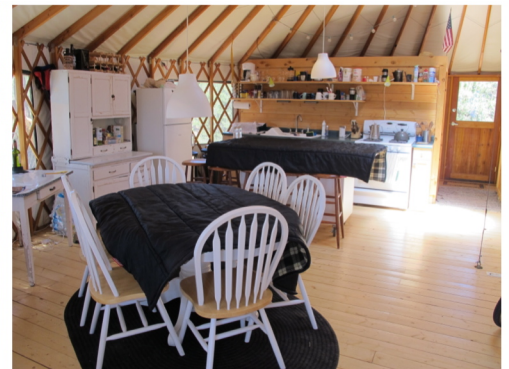
Cover Tables with Duvets When Leaving