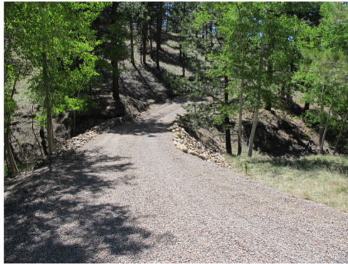
Turn Right onto Driveway