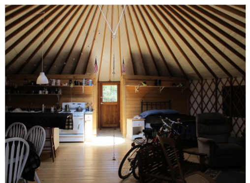
Inside Closed up Yurt