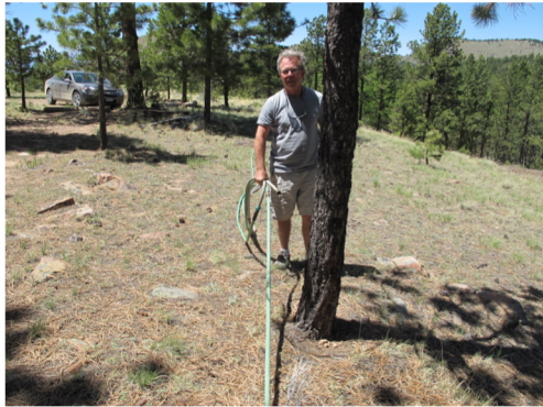
Laying Hose Pipe