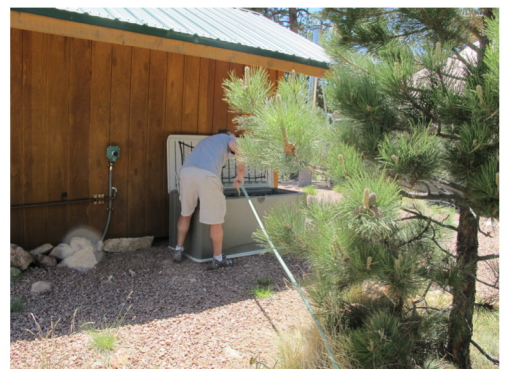
Beginning to Lay Hose Pipe