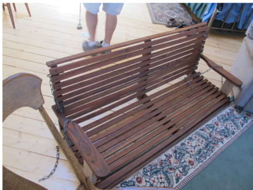
The Swing Bench