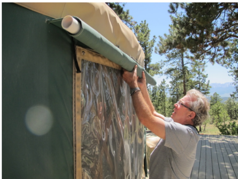
Reached the Top