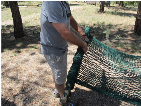
Unfurling the Hammock