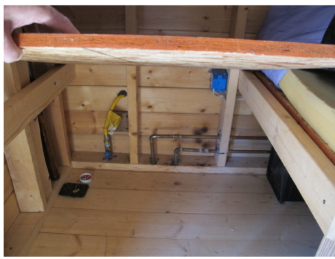
Gas Tap Behind Wall and Under Shelf