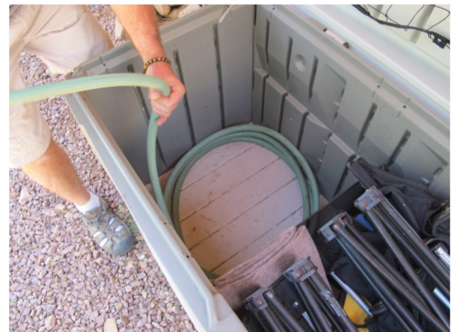
Slowly Unfurl Hos