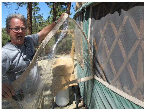
Removing the Vinyl Windows From Velcro