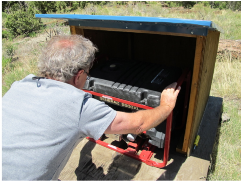
Pull Out Generator . It's Heavy