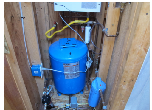
Water Heater Gas and Electric Plug -