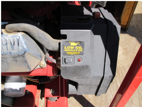
Oil Warning Control On