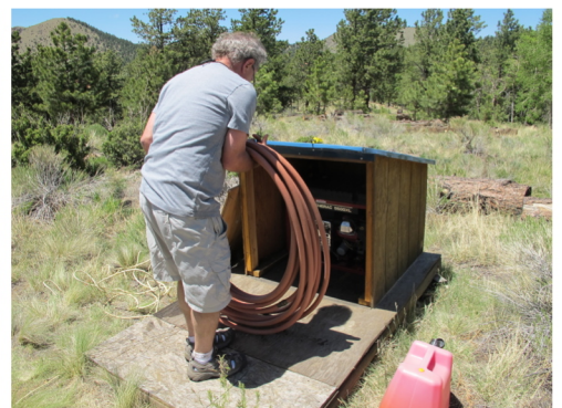
Remove Hose Pipe from Box