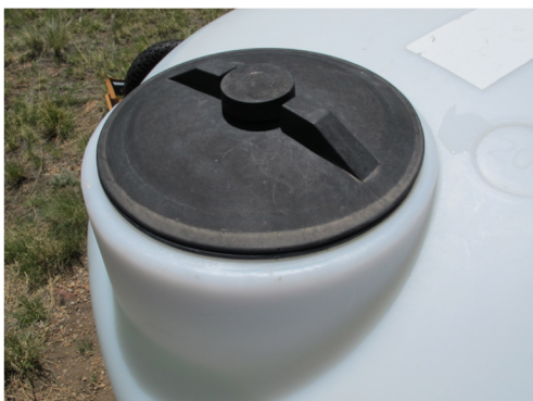
Cap to Tank