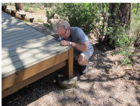
Reaching The Key