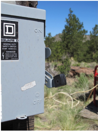
Lever to Activate Water Supply