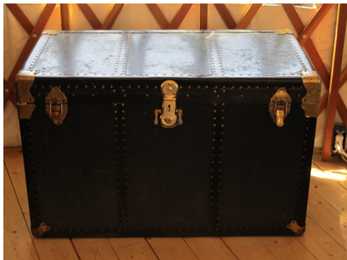
Trunk with Blankets / Duvets