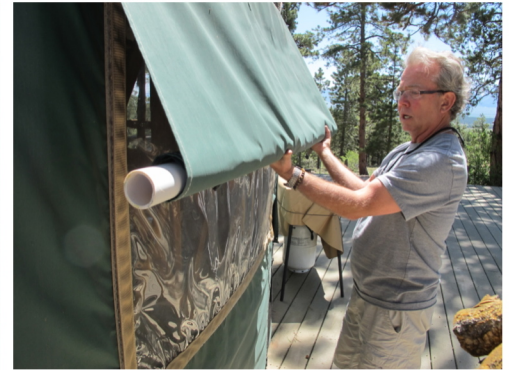
Keep Rolling Tight and Even