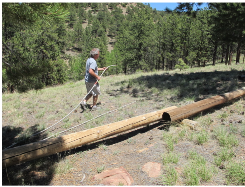
Laying Hose Pipe