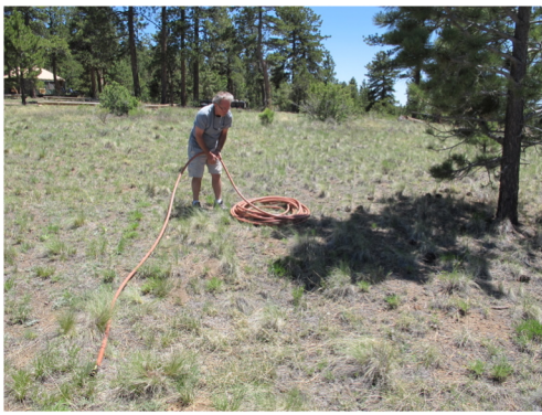
Lay Hose Pipe Out & Connect to Hose From Wooden Shed