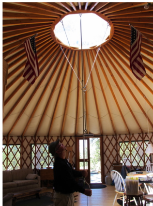
Turning the Pole to Open