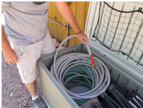
Water Supply Hose X 5