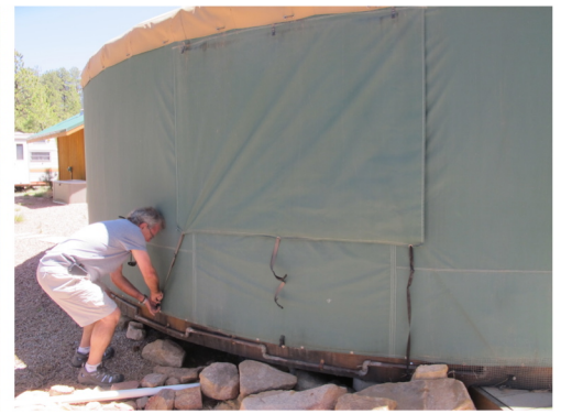
Unclip the Material from the Base