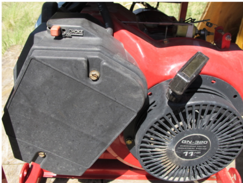
Starter Motor and Choke Lever