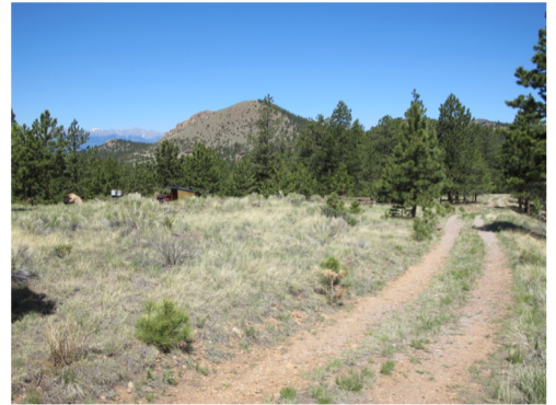
Location of Generator and Wellhead