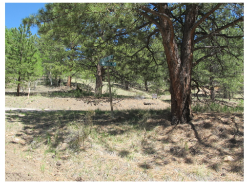
Edelweiss & Wintergreen Way