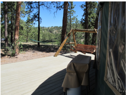
Bench & Hammock In Place