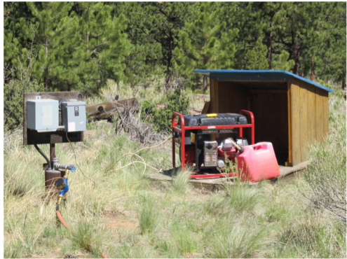
Wellhead Pump and Generator