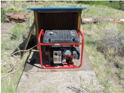
Generator Resting on Plinth