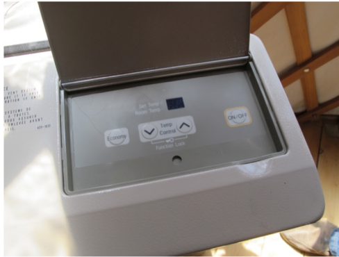
Heater Control Panel