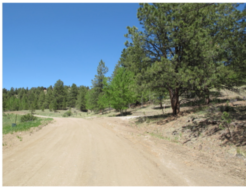
Arriving at the Junction